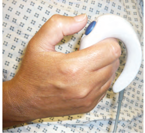
PCA handset button

Each PCA pump comes with its own handset. You hold this in your hand and press the button (as shown right), when you need pain relief. When you press the button, the pump delivers the pain relief medication through a small plastic tube (cannula) into a vein in your arm or hand. The tube is put in place before or during your operation (see picture below right).