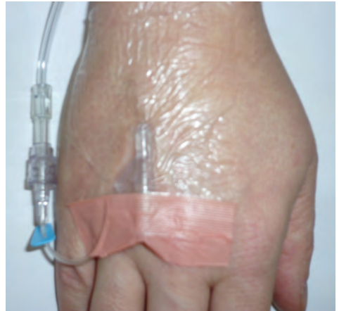
Cannula into a vein that allows PCA

Only you are allowed to press the button, not the nurses or your relatives and visitors. Immediately after your operation, the recovery room nurses will manage your pain relief until you are awake enough to press the button yourself.